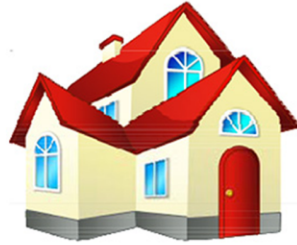
[Click for larger picture]